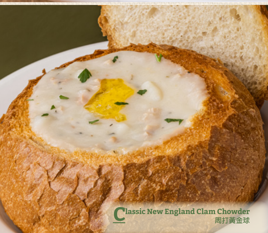
C lassic New England Clam Chowder 周打黃金球