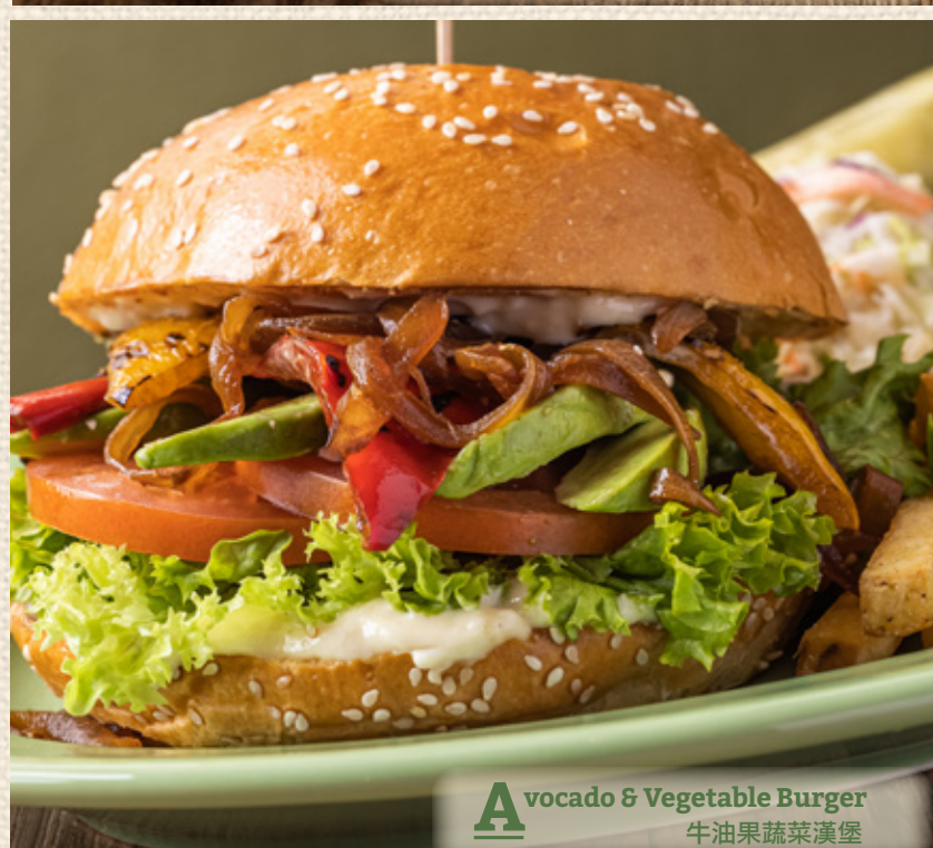
A vocado & Vegetable Burger 牛油果蔬菜漢堡