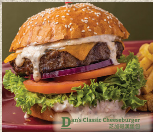
Dan's Classic Cheeseburger 芝加哥漢堡包