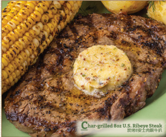
Char-grilled 8oz U.S. Ribeye Steak 炭烤8安士肉眼牛扒