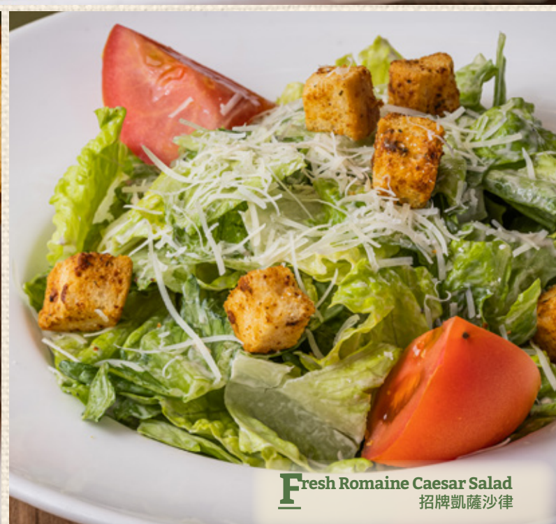
F resh Romaine Caesar Salad 招牌凱薩沙律