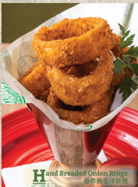
H and Breaded Onion Rings 香炸黃金洋葱圈

ADD DAN'S LUNCH-SIZED APPETIZERS! 享用芝加哥精選可以另點 Dan's 精選頭盤！