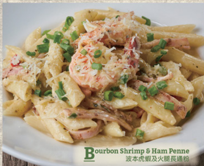
B ourbon Shrimp & Ham Penne 波本虎蝦及火腿長通粉

..... Substitute Creamy Potato Salad for $20! Baked Potato, Mashed Potato for $20! 加 $20 可配薯仔沙律: 加 $20 可配焗薯或薯蓉