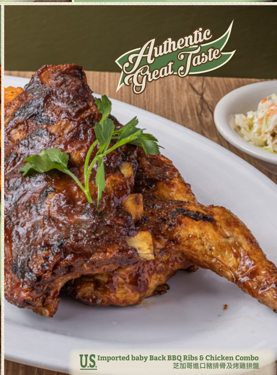
U.S. Imported baby Back BBQ Ribs & Chicken Combo 芝加哥進口豬排骨及烤雞拼盤