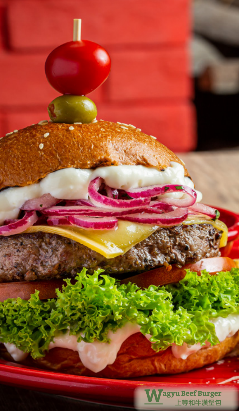
W agyu Beef Burger 上等和牛漢堡包