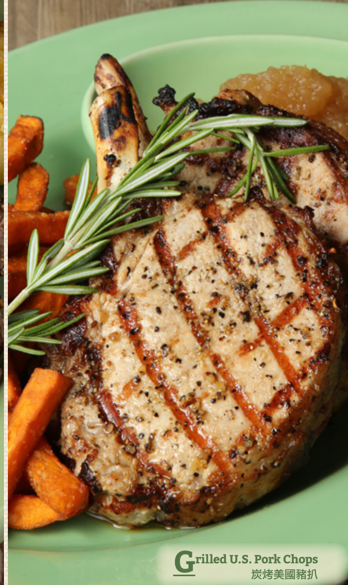
G rilled U.S. Pork Chops 炭烤美國豬扒