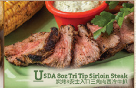
USDA 8oz Tri Tip Sirloin Steak 炭烤8安士入口三角肉西冷牛扒