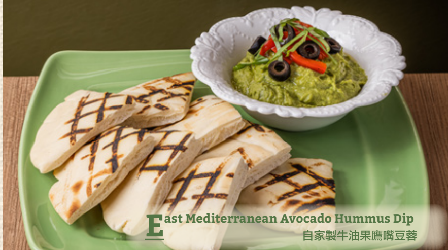
E ast Mediterranean Avocado Hummus Dip 自家製牛油果鷹嘴豆蓉