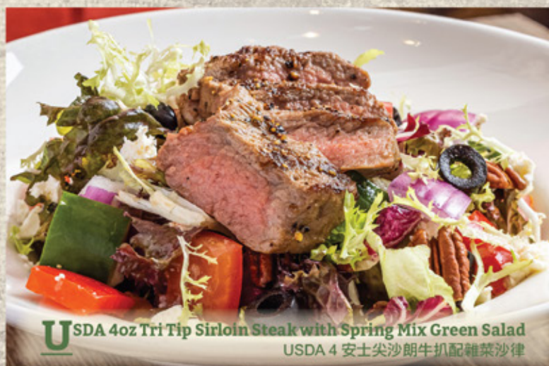
USDA 4oz Tri Tip Sirloin Steak with Spring Mix Green Salad USDA 4 安士尖沙朗牛扒配雜菜沙律