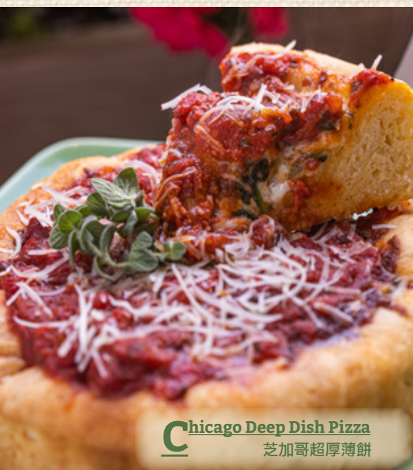
C hicago Deep Dish Pizza 芝加哥超厚薄餅