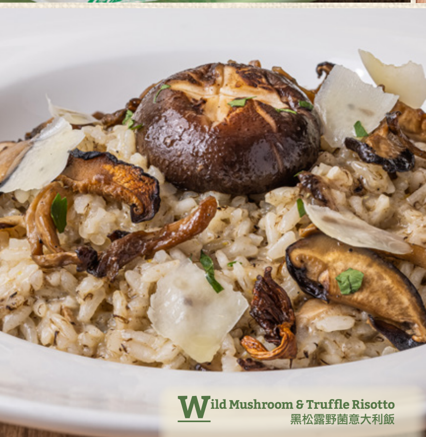
W ild Mushroom & Truffle Risotto 黑松露野菌意大利飯