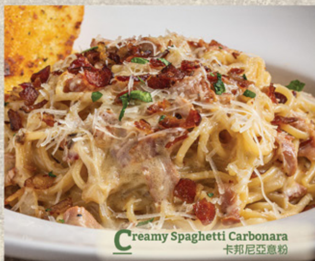
Creamy Spaghetti Carbonara 卡邦尼亞意粉