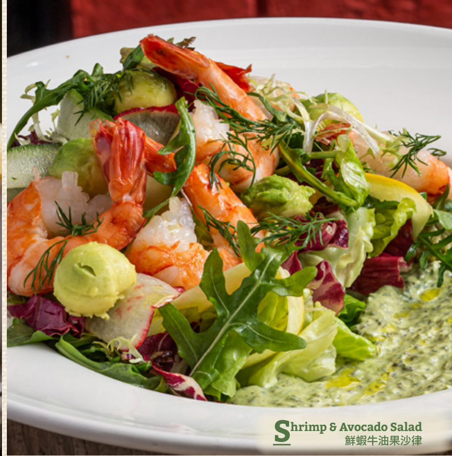
S hrimp & Avocado Salad 鮮蝦牛油果沙律