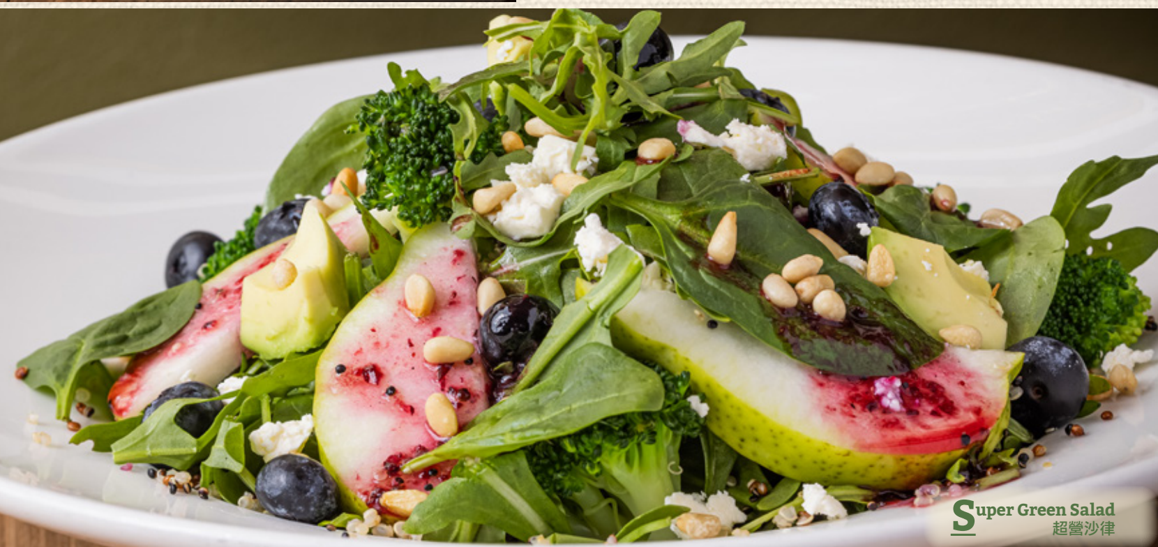
S uper Green Salad 超營沙律