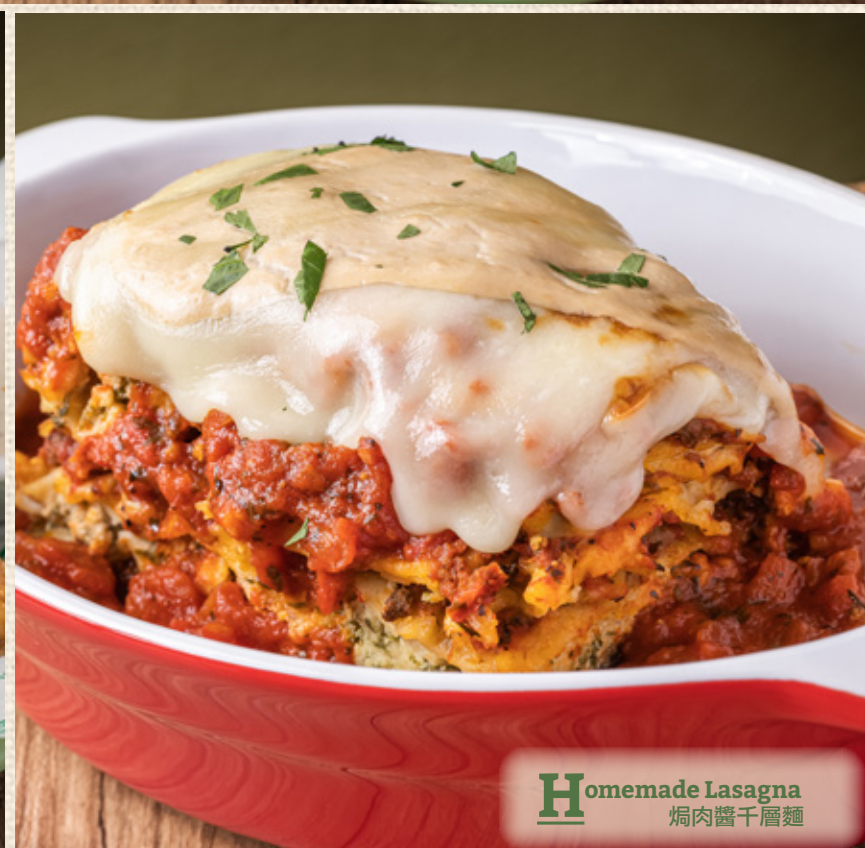
H omemade Lasagna 焗肉醬千層麵