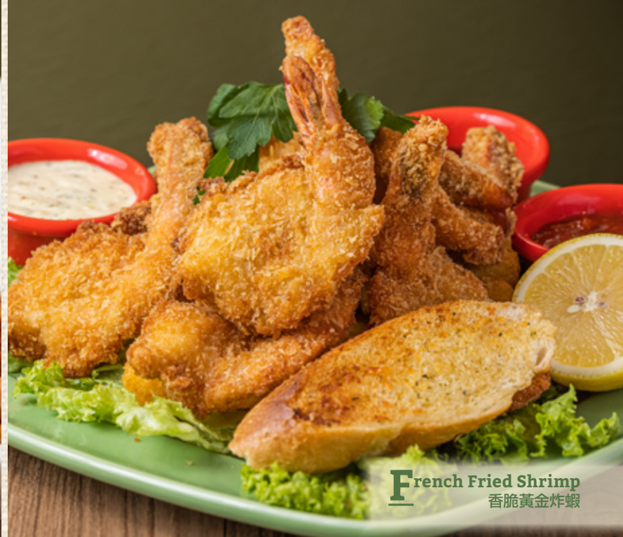
F rench Fried Shrimp 香脆黃金炸蝦