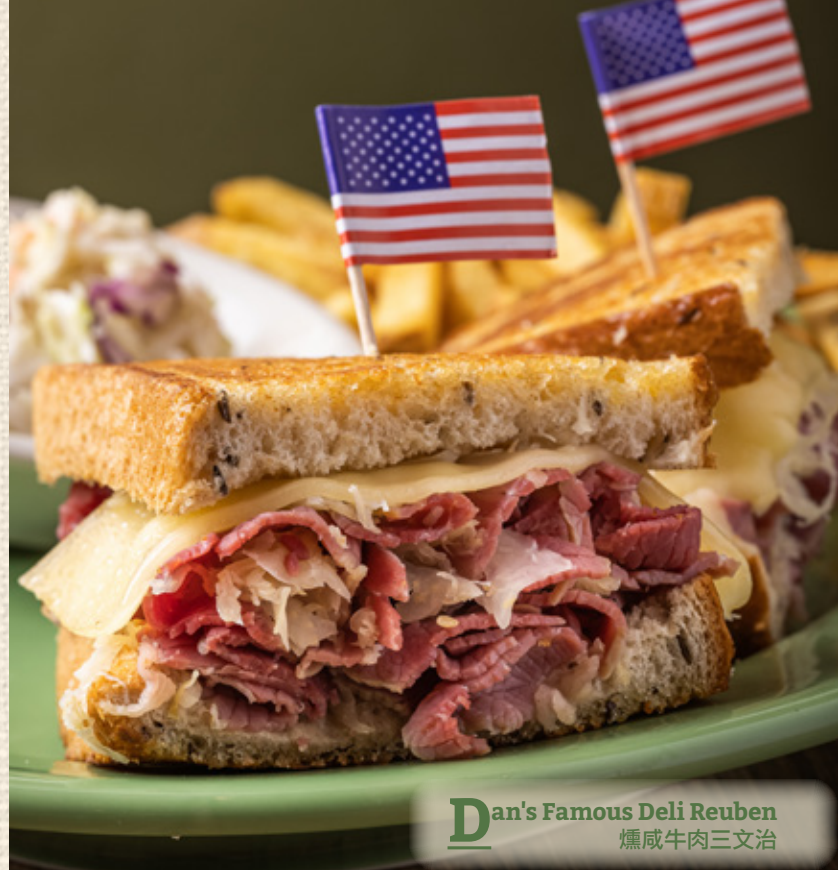
D an's Famous Deli Reuben 燻咸牛肉三文治