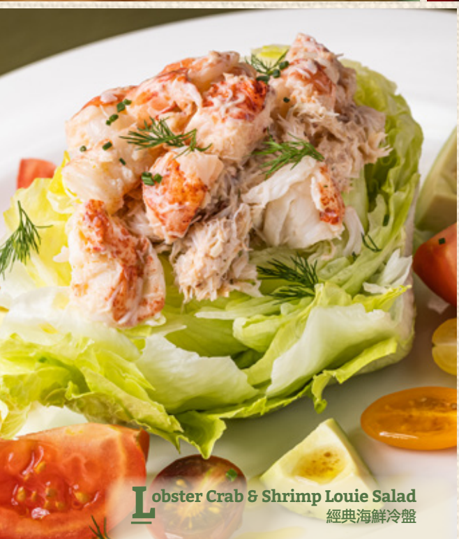
L obster Crab & Shrimp Louie Salad 經典海鮮冷盤