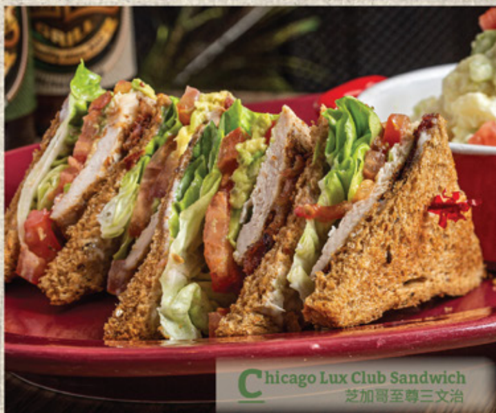
C hicago Lux Club Sandwich 芝加哥至尊三文治