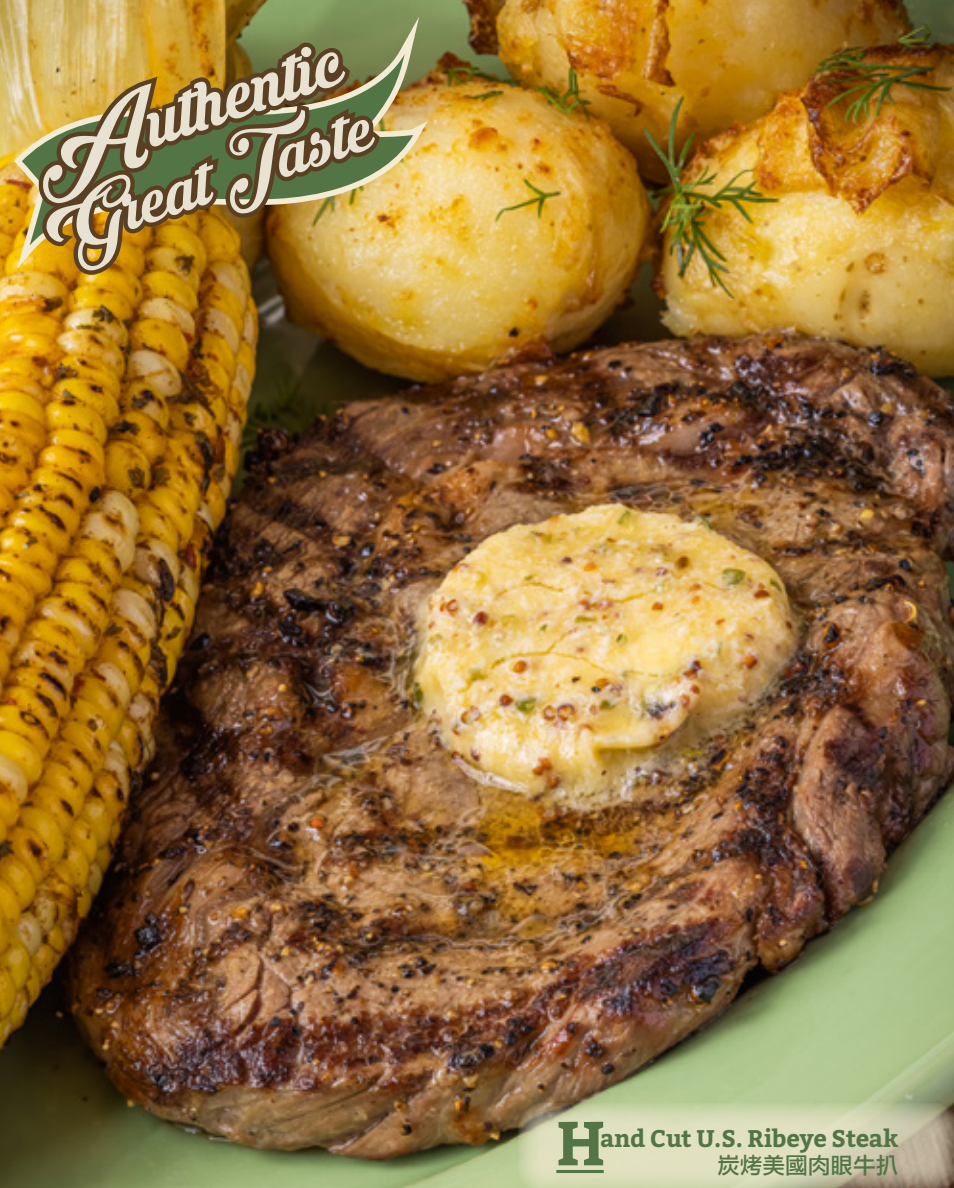
H and Cut U.S. Ribeye Steak 炭烤美國肉眼牛扒