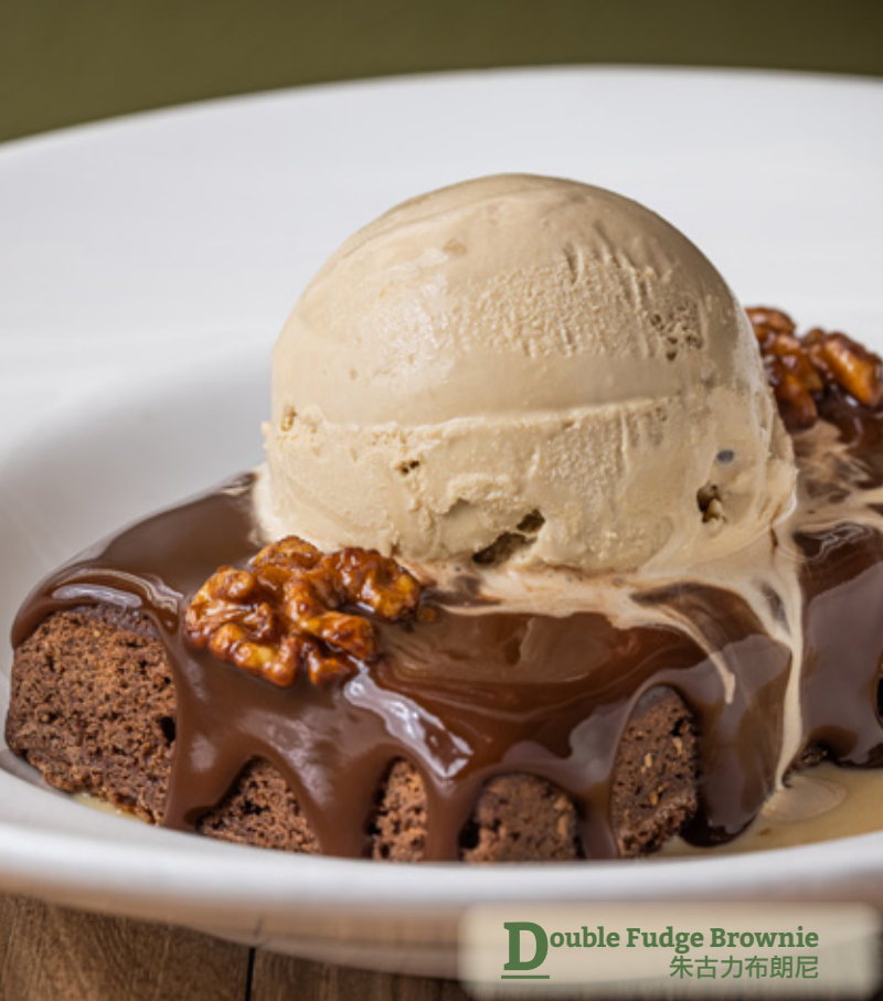
D ouble Fudge Brownie 朱古力布朗尼