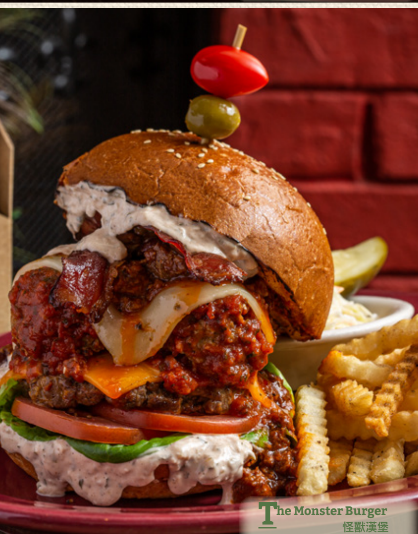
T he Monster Burger 怪獸漢堡