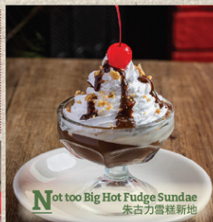
N ot too Big Hot Fudge Sundae 朱古力雪糕新地

★ ADD A DESSERT ★ Not too Big Hot Fudge Sundae 62 朱古力雪糕新地