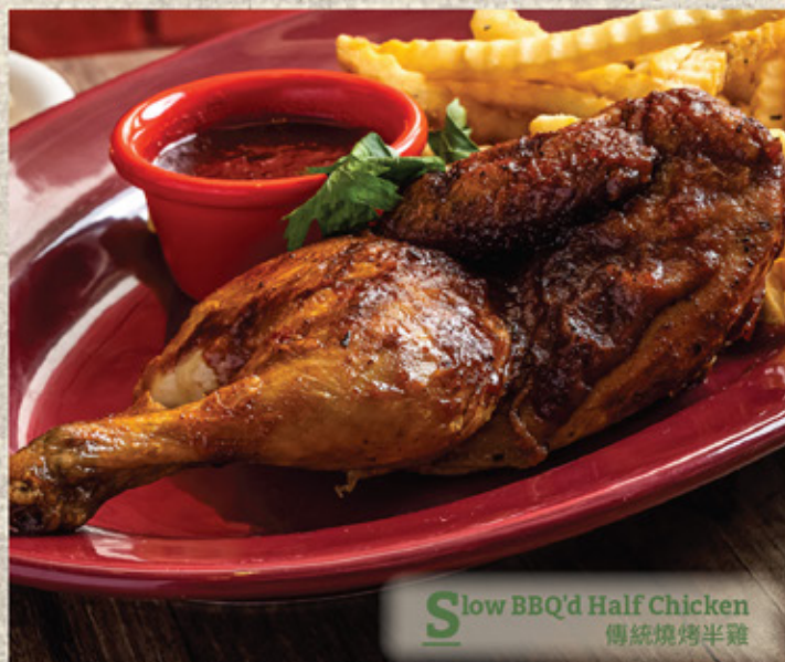
S low BBQ'd Half Chicken 傳統燒烤半雞

Italian Parma Ham & Mozzarella Pizza 145 意大利巴馬火腿芝士薄餅