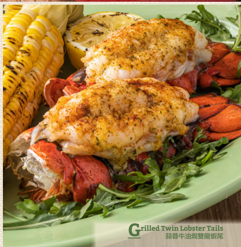
G rilled Twin Lobster Tails 蒜蓉牛油焗雙龍蝦尾