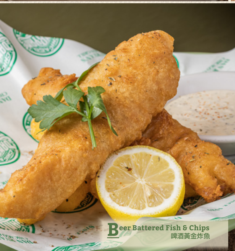
B eer Battered Fish & Chips 啤酒黃金炸魚