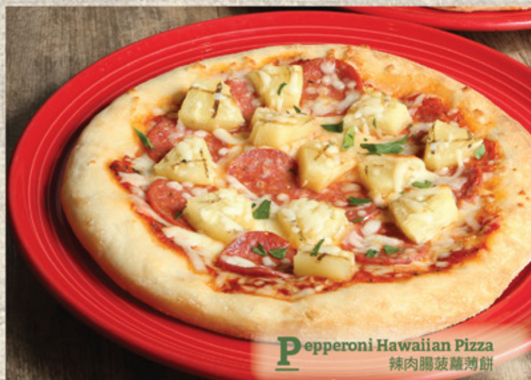
Pepperoni Hawaiian Pizza 辣肉腸菠蘿薄餅

Philly Cheese Steak Sandwich with Peppers & Onions with French Fries 費城牛肉三文治配薯條