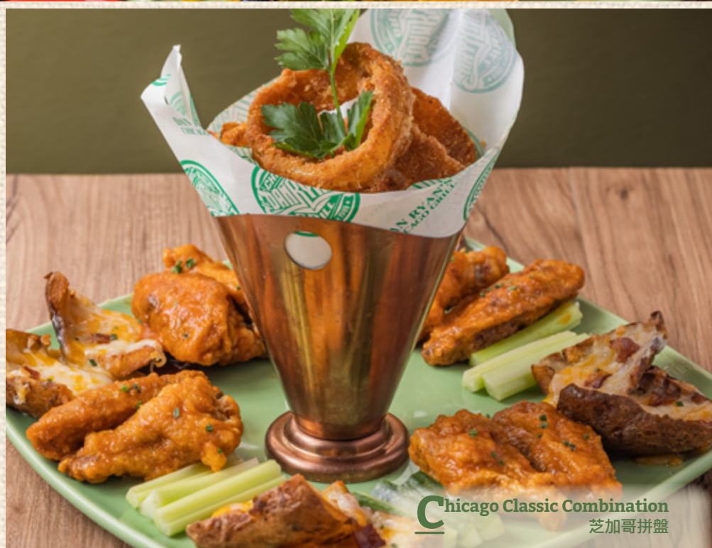
C hicago Classic Combination 芝加哥拼盤