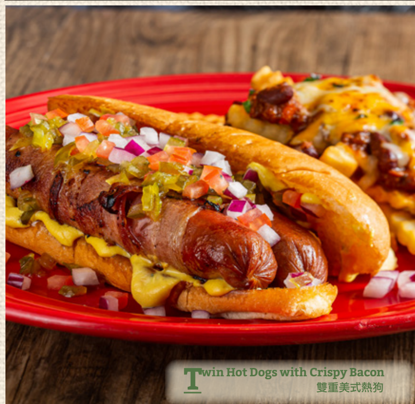
T win Hot Dogs with Crispy Bacon 雙重美式熱狗