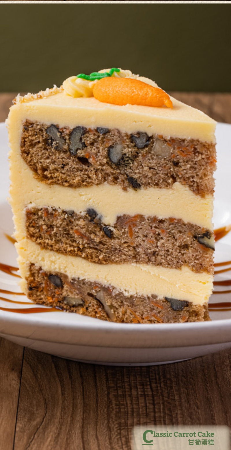
C lassic Carrot Cake 甘筍蛋糕