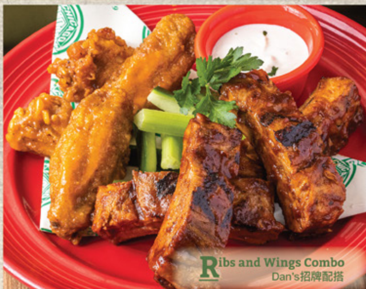
R ibs and Wings Combo Dan's招牌配搭