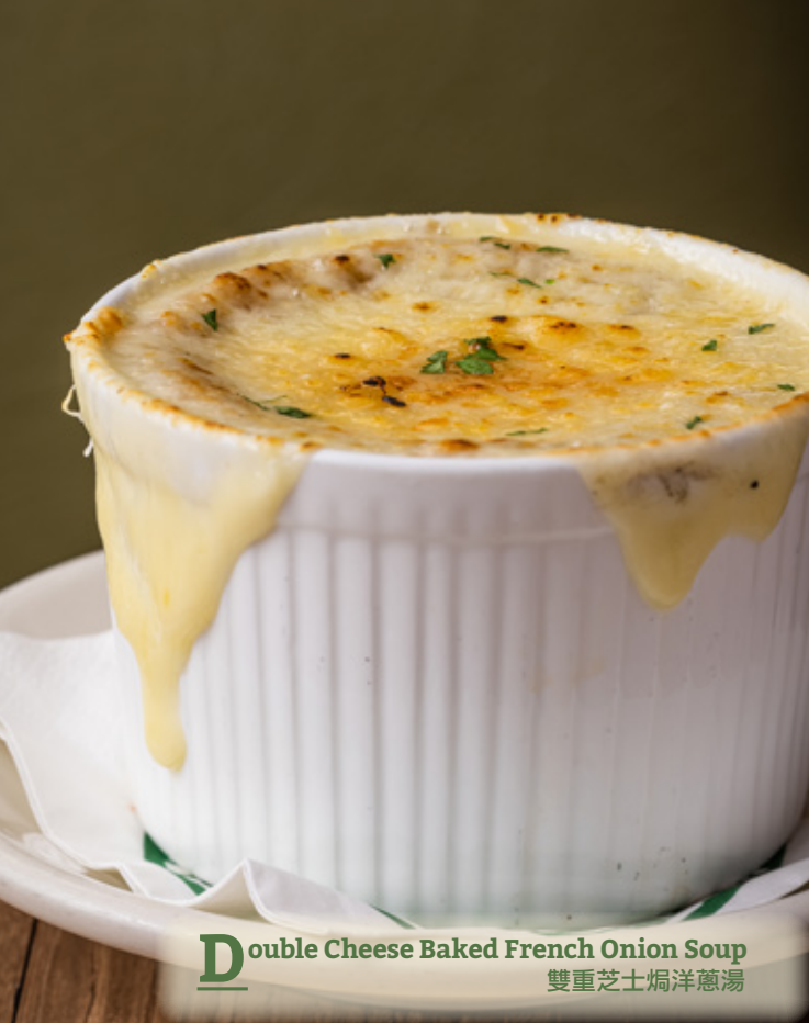
D ouble Cheese Baked French Onion Soup 雙重芝士焗洋蔥湯