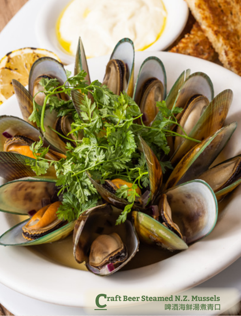
C raft Beer Steamed N.Z. Mussels 啤酒海鮮湯煮青口