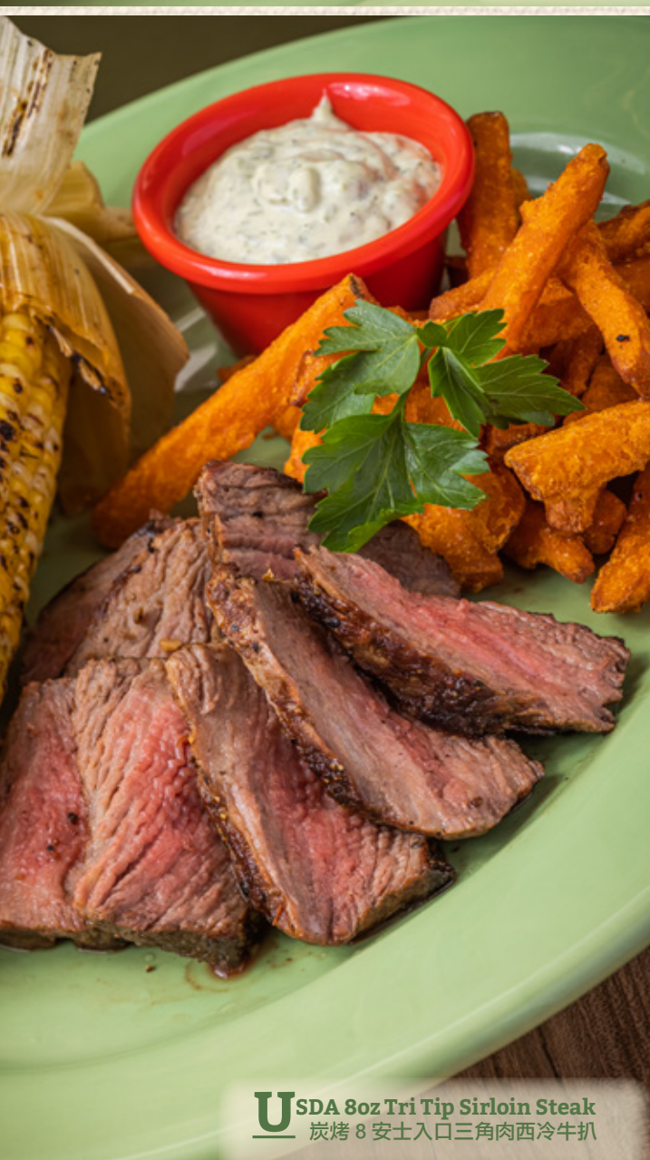
U SDA 8oz Tri Tip Sirloin Steak 炭烤 8 安士入口三角肉西冷牛扒