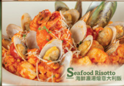
Seafood Risotto 海鮮濃湯燴意大利飯