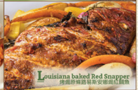
Louisiana baked Red Snapper 烤燻原條路易斯安那燻紅鯛魚