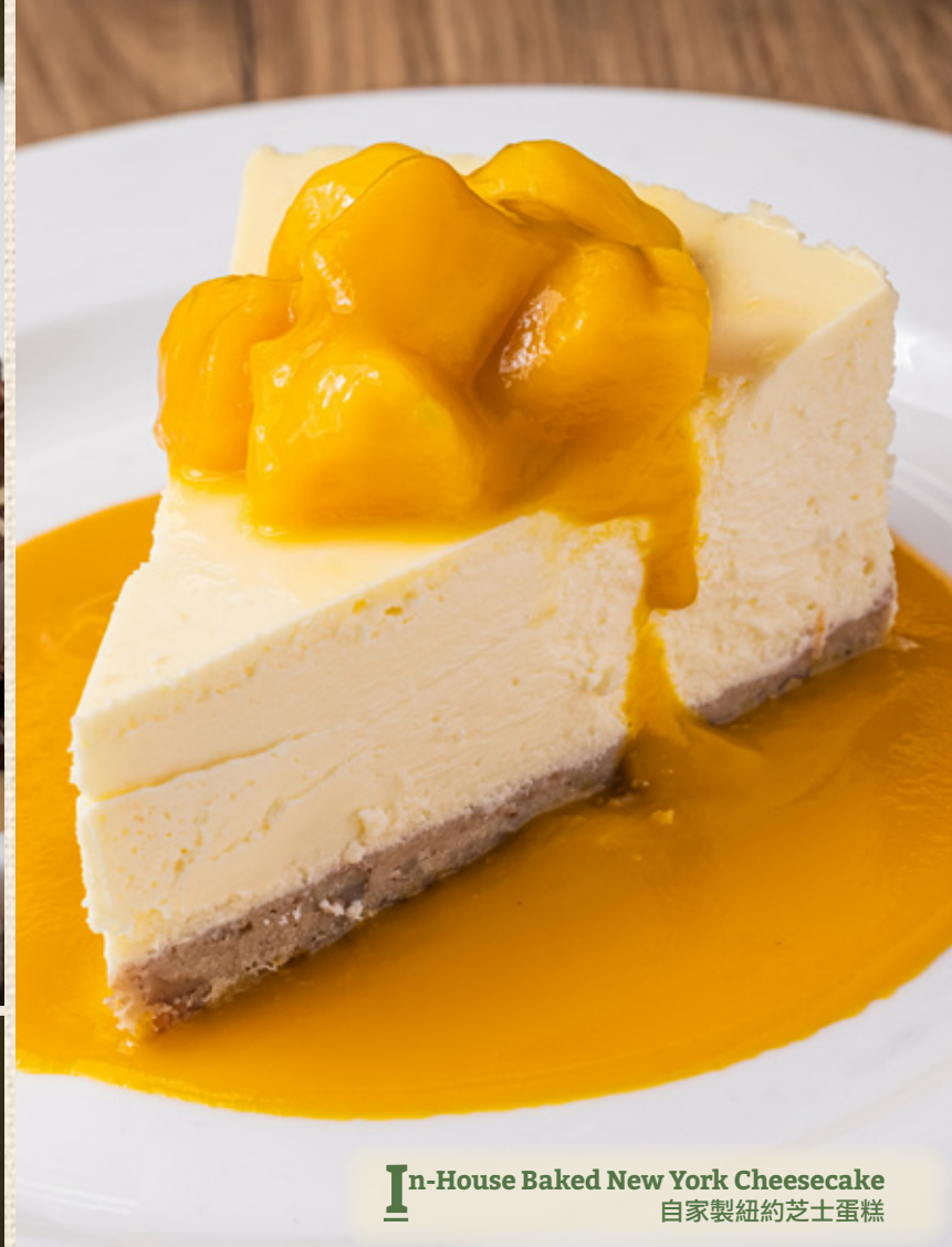
I n-House Baked New York Cheesecake 自家製紐約芝士蛋糕