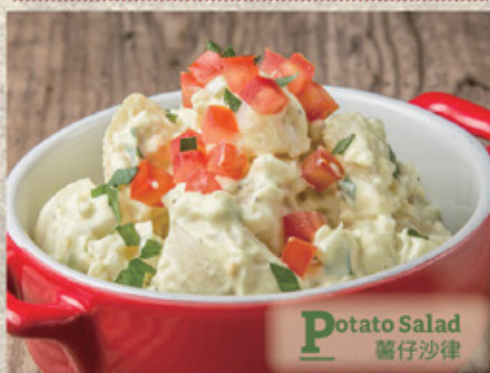
P otato Salad 薯仔沙律

★ ADD AN APPETIZER ★ Hand Breaded Onion Rings 58 香炸黃金洋葱圈 House-made Creamy Potato Salad 38 薯仔沙律