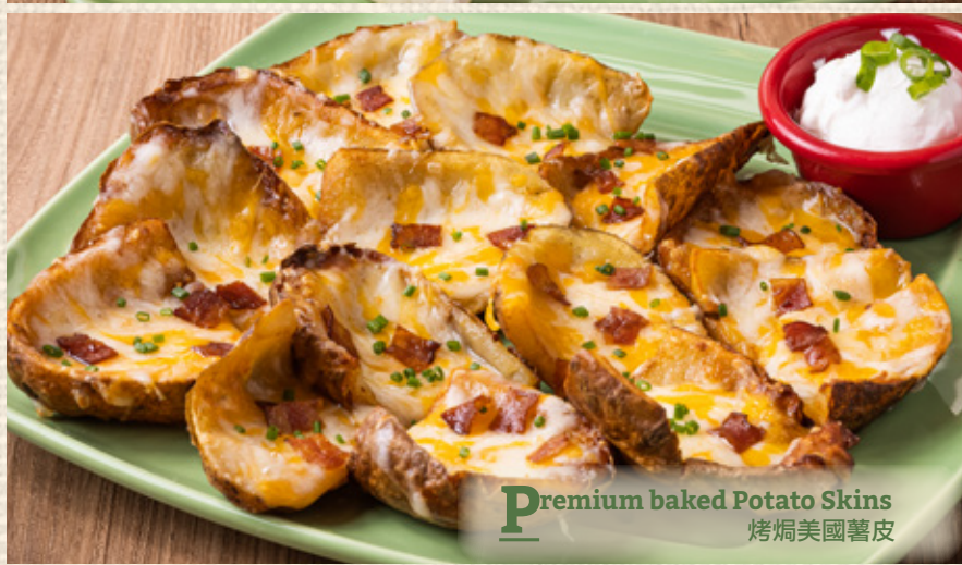
P remium baked Potato Skins 烤焗美國薯皮