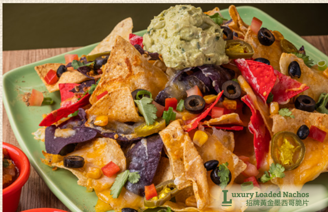
L uxury Loaded Nachos 招牌黃金墨西哥脆片