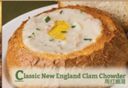
Classic New England Clam Chowder 周打蜆湯