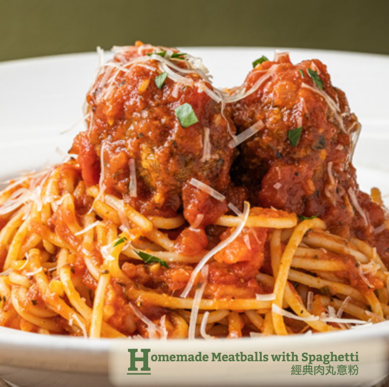
H omemade Meatballs with Spaghetti 經典肉丸意粉