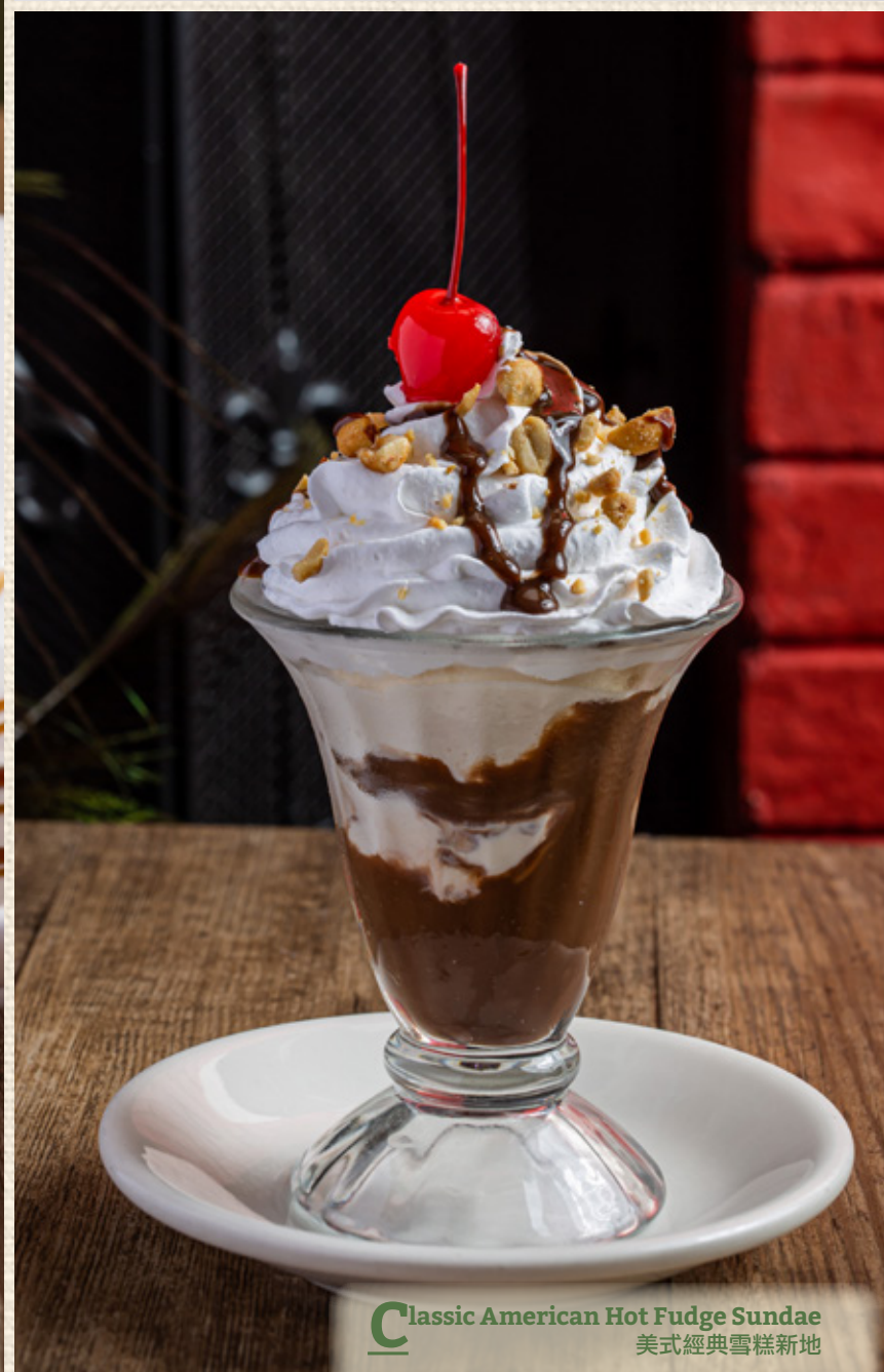
C lassic American Hot Fudge Sundae 美式經典雪糕新地